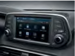
7" LCD Floating Touch Screen Infotainment System