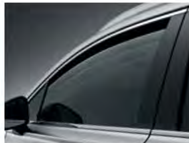
Safety Power Window (Driver's seat only)