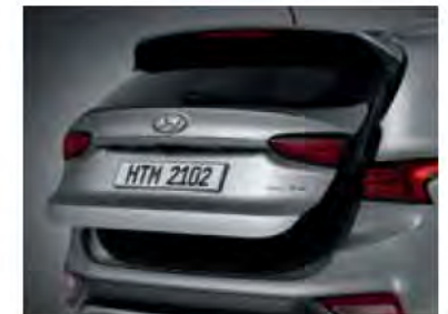
Smart Tailgate System