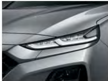
LED Daytime Running Lights (DRL)