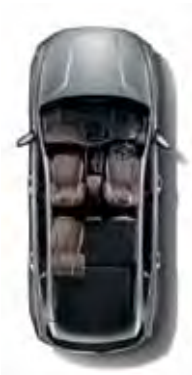
3rd row folded and 2nd row folded 60%