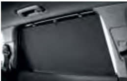
Rear Door Manual Curtain