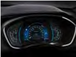
7" TFT LCD Supervision Cluster