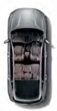
3rd row folded