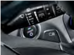
Paddle Shifter (Lever Type)