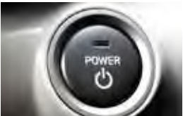
Smart Key & Push Button Start