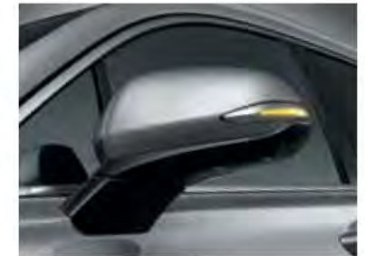
LED Outside Mirror Repeaters