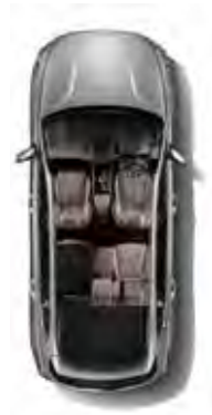
3rd row folded and 2nd row folded 40%