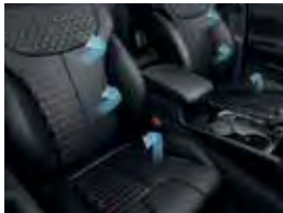
Front Seat Warming & Cooling Air Ventilation