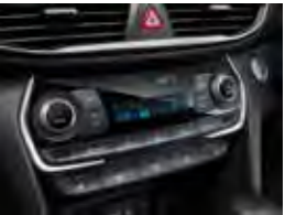
Full Auto Temperature Air Conditioner with Cluster Ionizer