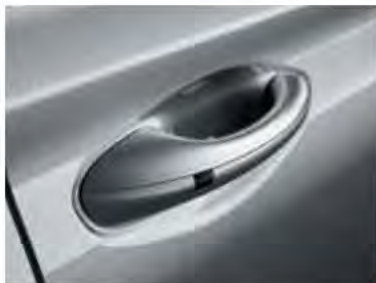
Outdoor Handles with Satin Chrome Coating