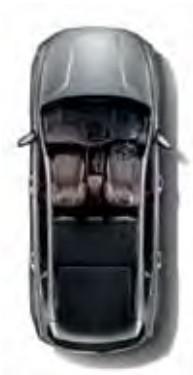
2nd and 3rd row folded